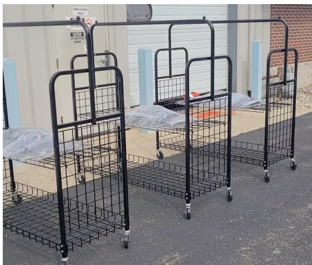
Rack Hanging System